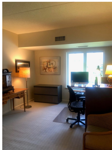
Second bedroom and hall bath