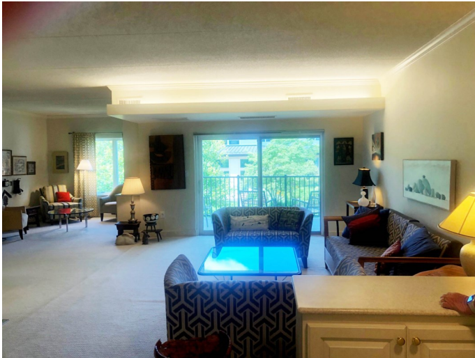
Living Room with northern exposure and open den