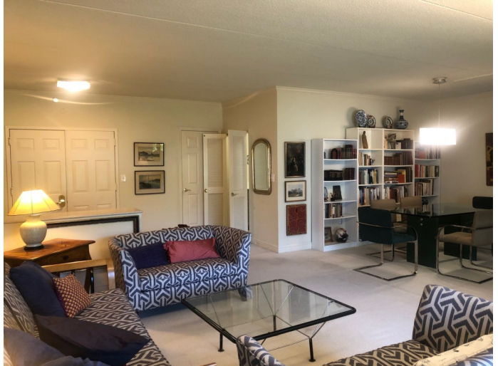
Living / Dining area