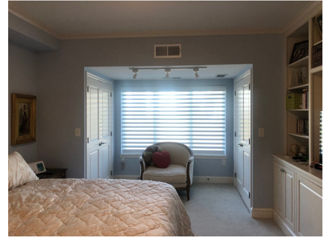
Master Bedroom and Master Bath with built-ins