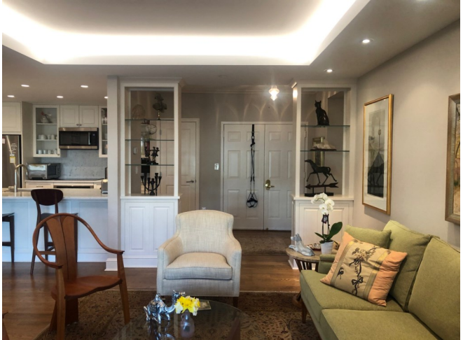
Beautiful Living Room with incredible lighting