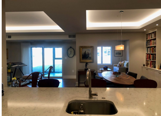
Beautiful Open Concept Custom Kitchen