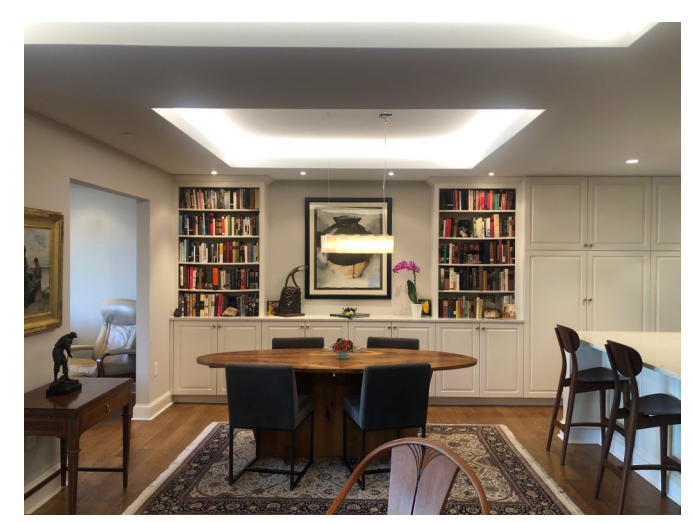
Dining Area with Built-ins

* Plus a $59,192.00 one-time special assessment for our campus building enhancement project. Call for details!