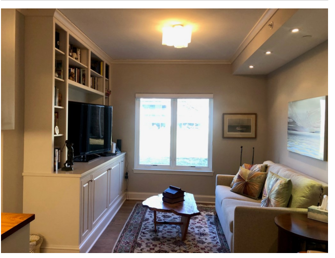
Cozy Den with Built-ins