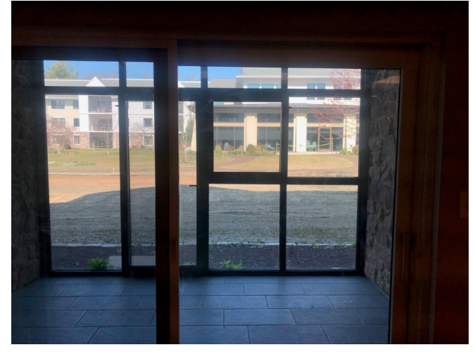
Enclosed patio with beautiful view of courtyard with new plantings and seating! Also easy access to the common areas across the way!