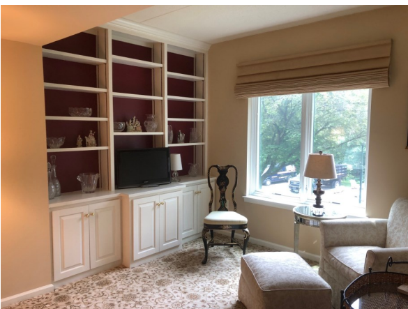
Cozy Den with built-ins

Thank you for your interest in Beaumont. This Pine apartment is located on the first floor of the Baldwin Building and has a southern exposure. The monthly fee for this apartment is $6,627 (single occupancy) and $8,778 (double occupancy). There is also a $350 per month capital assessment fee.