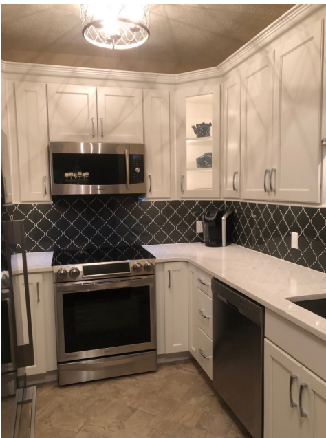
Renovated Galley Kitchen