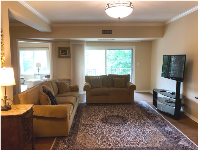
Spacious Living Room