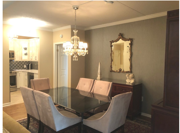
A warm welcoming Dining Room open to Living Room