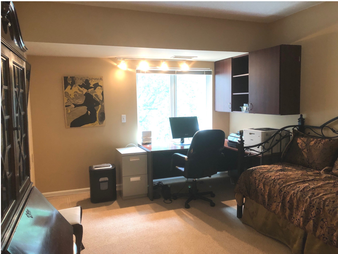
Second bedroom or office