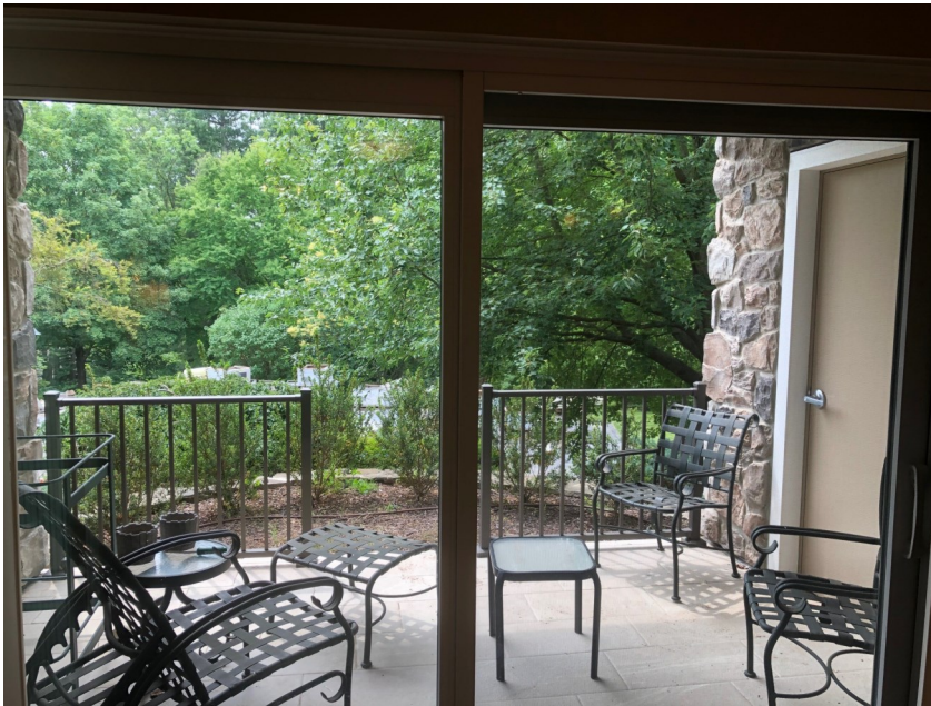
Beautiful patio with garden space