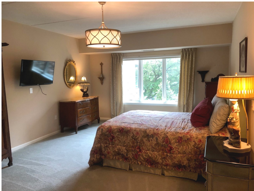
Master Bedroom with walk-in closet