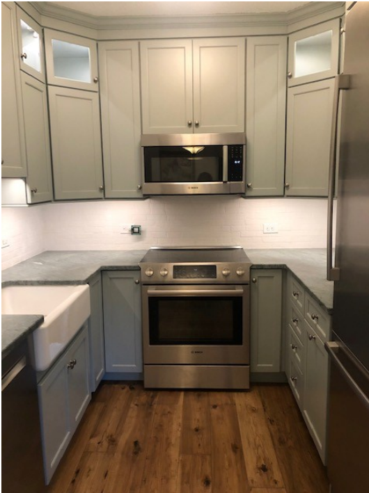
This kitchen is perfect featuring extra counter space and Bosch appliances.