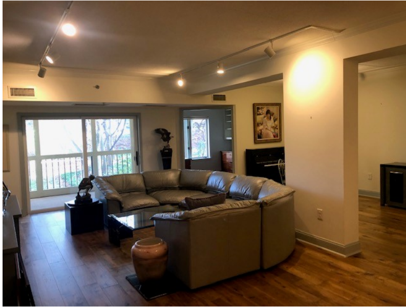
The Living room is a true space to relax and live!