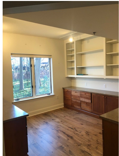
This den has been conformed to awesome office space. Everything a person would expect to find in a true office.

$695,000.00* TWO BEDROOM WITH DEN TWO BATH PINE APARTMENT 1,533 SF