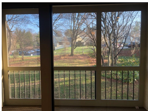
Enjoy waking up to the sun with your coffee on your enclosed balcony.