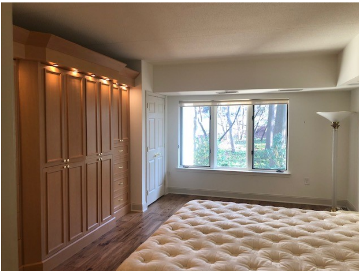
The Master Bedroom offers beautiful built in storage, an additional closet and a completely outfitted Master Closet.