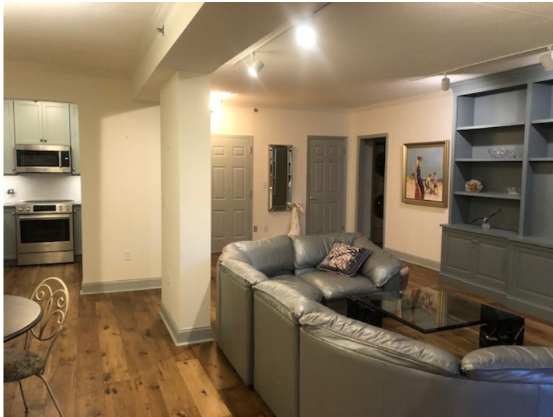
Living Room boasts high end crafted cabinetry.

$695,000.00* TWO BEDROOM WITH DEN TWO BATH PINE APARTMENT 1,533 SF