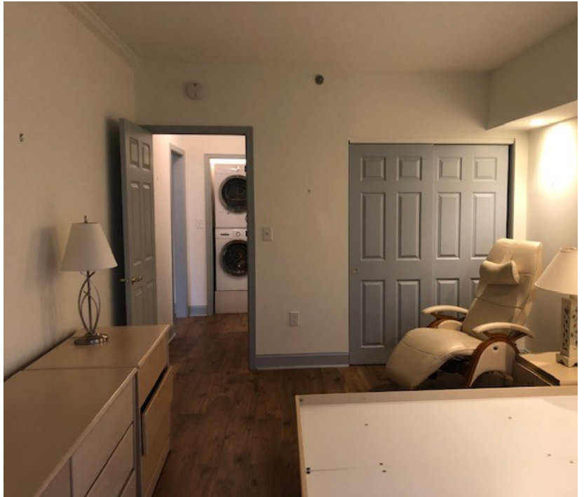
Your guests will be spoiled when staying with you in this lovely space. They will have their own private bathroom right next door.