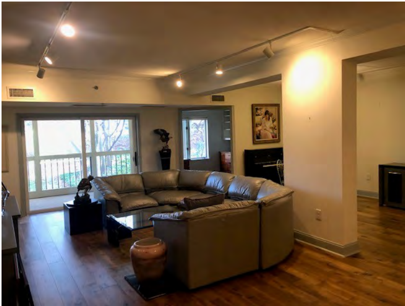
The Living room is a true space to relax and live!