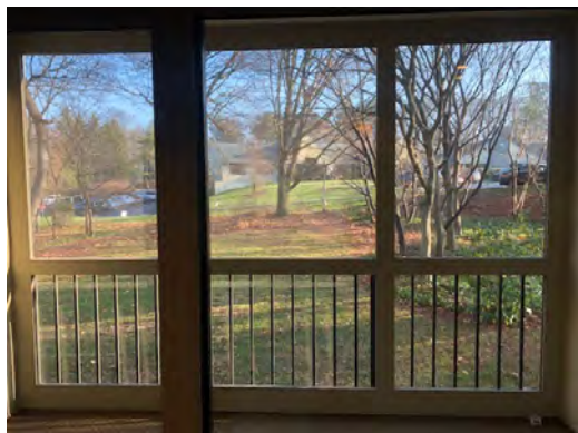
Enjoy waking up to the sun with your coffee on your enclosed balcony.