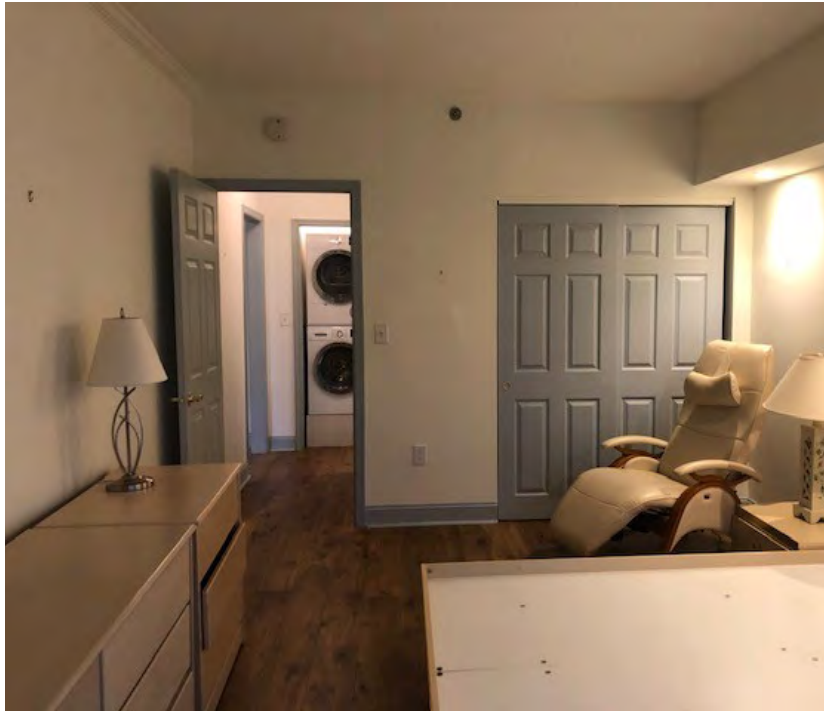
Your guests will be spoiled when staying with you in this lovely space. They will have their own private bathroom right next door.