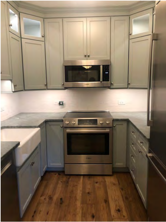
This kitchen is perfect featuring extra counter space and Bosch appliances.