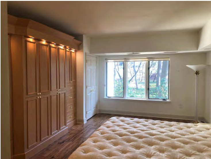
The Master Bedroom offers beautiful built in storage, an additional closet and a completely outfitted Master Closet.