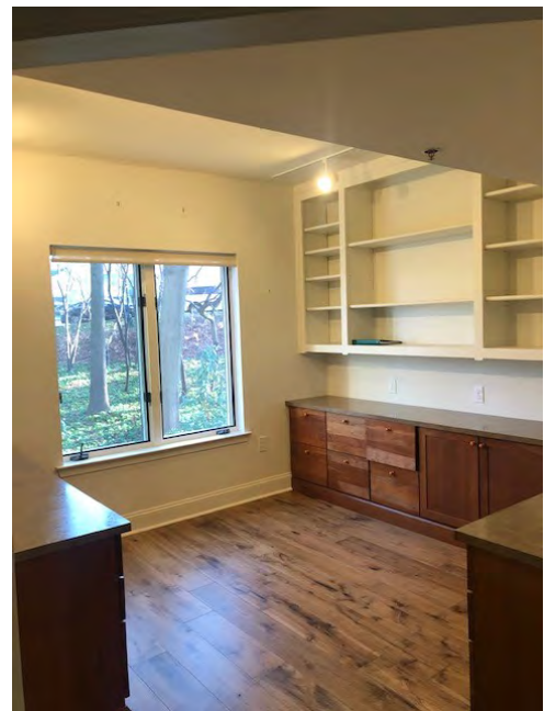
This den has been converted to awesome office space. Everything a person would expect to find in a true office.

$771,559.00* TWO BEDROOM WITH DEN TWO BATH PINE APARTMENT 1,533 SF