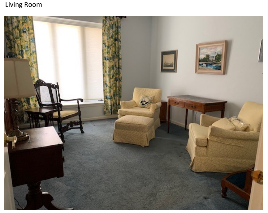
$800,000.00 * Seller is willing to consider any and all reasonable offers. TWO BEDROOM, THREE BATH, TWO LEVEL APPLE VILLA, 3,634 SF