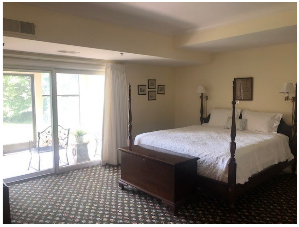
Master Bedroom with Enclosed Patio