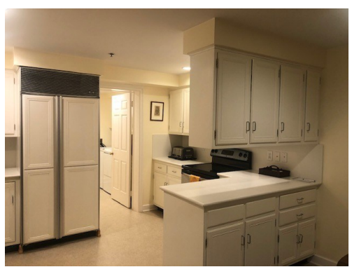
$1,000,000.00 * Seller is willing to consider any and all reasonable offers. BIRCH APARTMENT 2,326 SF

* Plus a one time assessment of $121,313.00 for our upcoming campus wide enhancement project. Call for details!